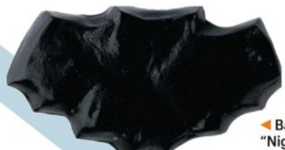
▲ Bat-shaped "Night-Wing" shower jelly, Dh40 ● www.lush-mena.com

▼ Eye spy French rock'n'roll label Zadig & Voltaire has revamped its classic unisex aviator sunglasses this Halloween. The mirrored lenses bear a skull print and the arms of the glasses are decorated with the brand's angel-wings logo. For those angling for a brighter and bolder look, Zadig & Voltaire's new collection also includes specs of electric orange, egg-yellow and pillar-box red. The sunglasses cost Dh650 a pair and are available at leading eyewear stores now. ● www.zadig-et-voltaire.com