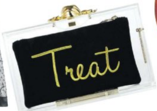
▲ Trick or treat Pandora perspex clutch with gold-tone hardware, Dh2,225