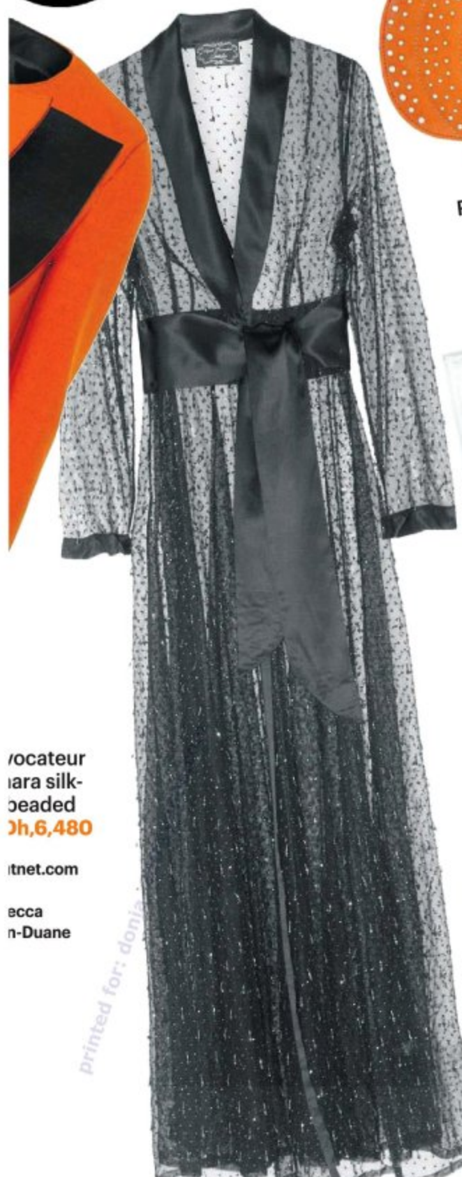
rocateur ara silk- beaded Dh6,480 tinet.com scca n-Duane