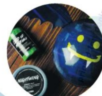
▲ Bat heebie-jeebie gift set with shower "scream" gel and foaming jelly, Dh120