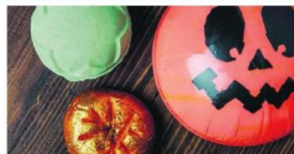
▲ Pumpkin gift set including "Lord of Misrule" and sparkly pumpkin bubble bar, Dh102