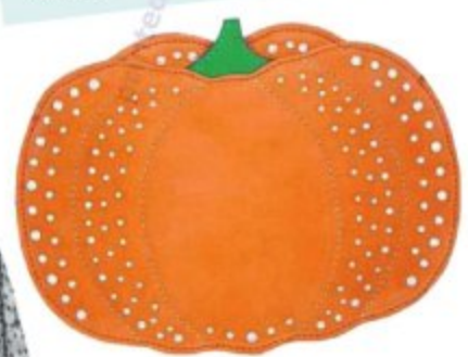
▲ Pumpkin suede clutch embellished with crystals, Dh1,450.